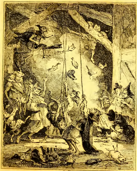
Meeting of Witches.